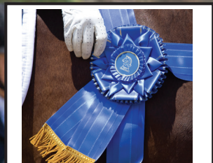
CENTRAL Aug 16-17 SBC