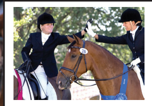
NORTH June 13-15 MEC