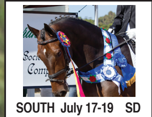
SOUTH July 17-19 SD

AWARDS: SADDLE PAD BAG ~ DUFFLE BAGS ~ NECK RIBBONS HIGH SCORE ELITE ~ HIGH SCORE NOVICE ROSES AWARD